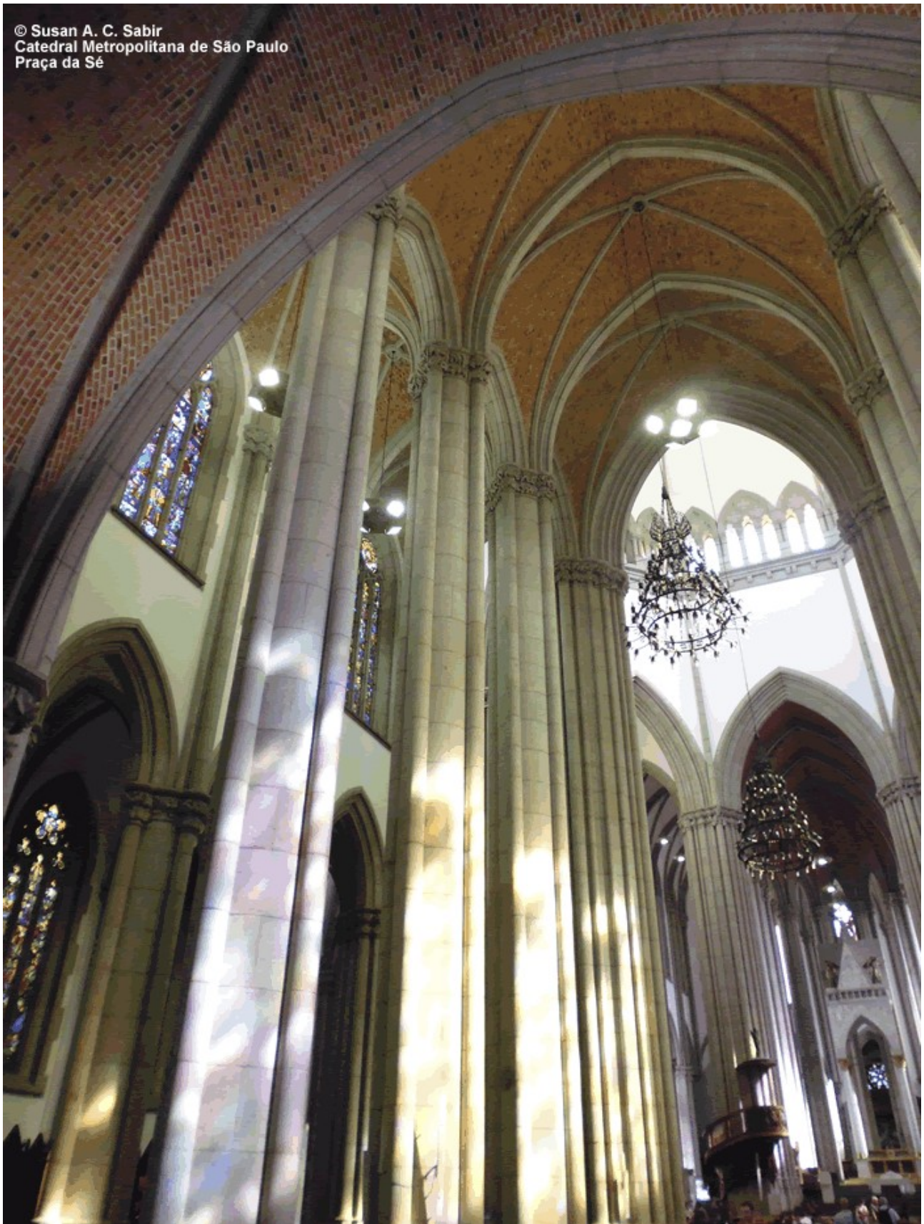
© Susan A. C. Sabir Catedral Metropolitana de São Paulo Praça da Sé