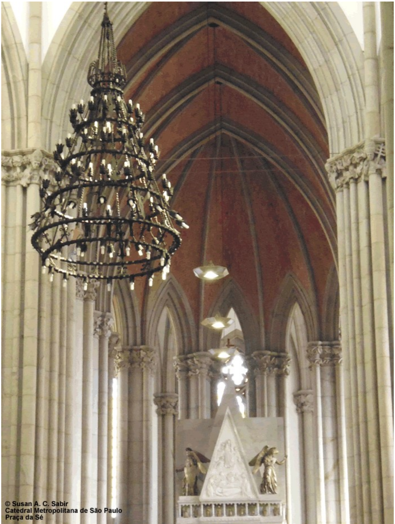
© Susan A. C. Sabir Catedral Metropolitana de São Paulo Praça da Sé