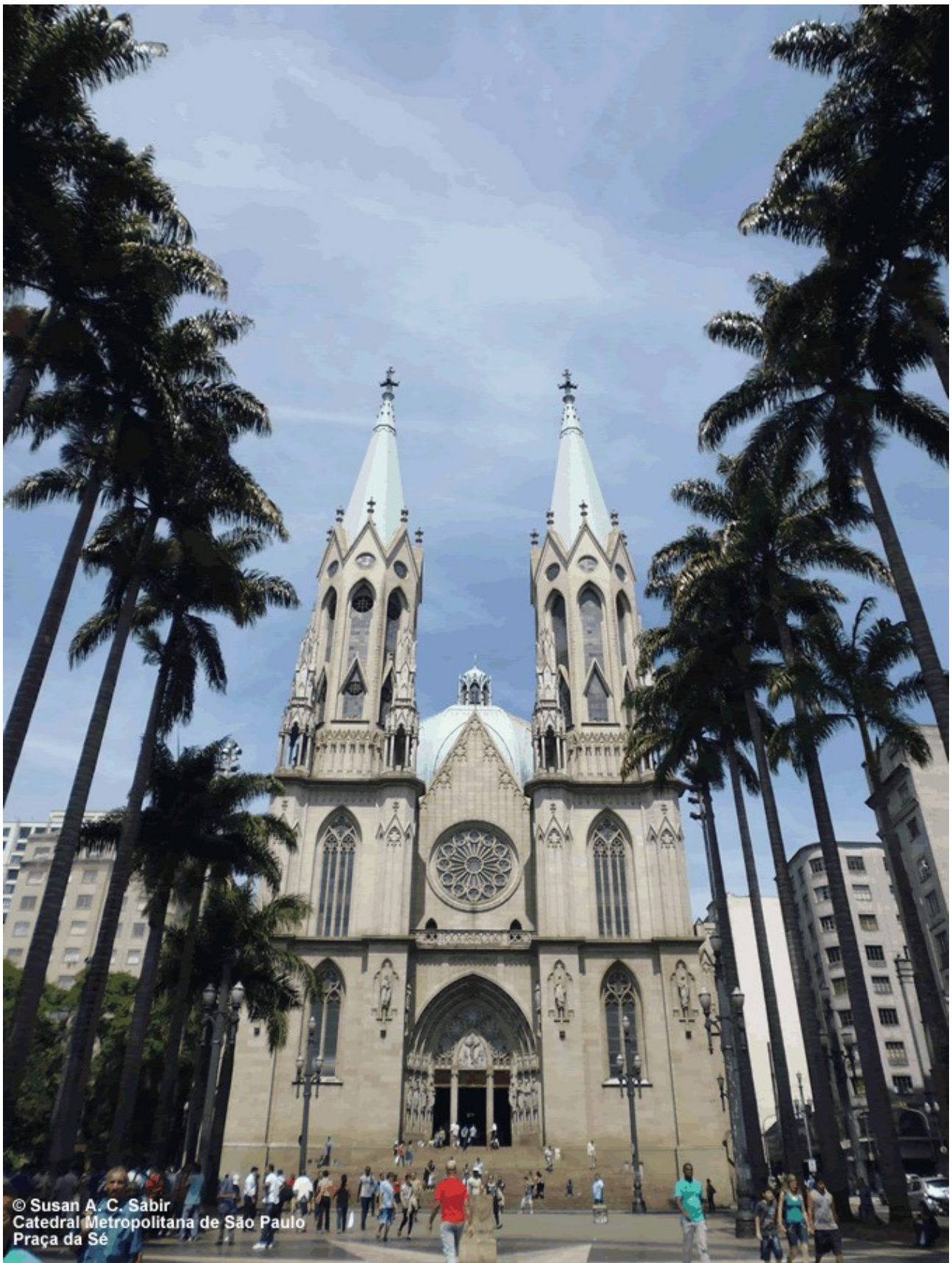
© Susan A. C. Sabir Catedral Metropolitana de São Paulo Praça da Sé